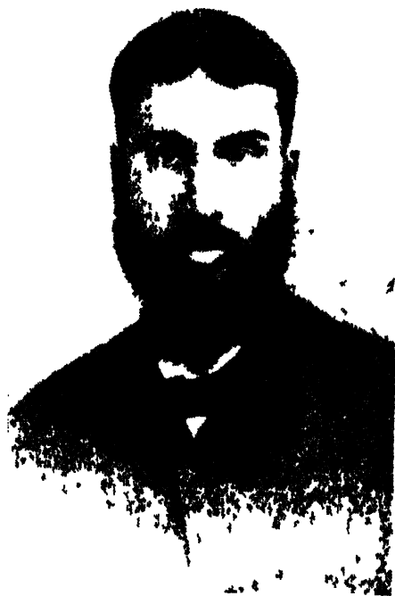
Pramatha Nath Bose in 1880.